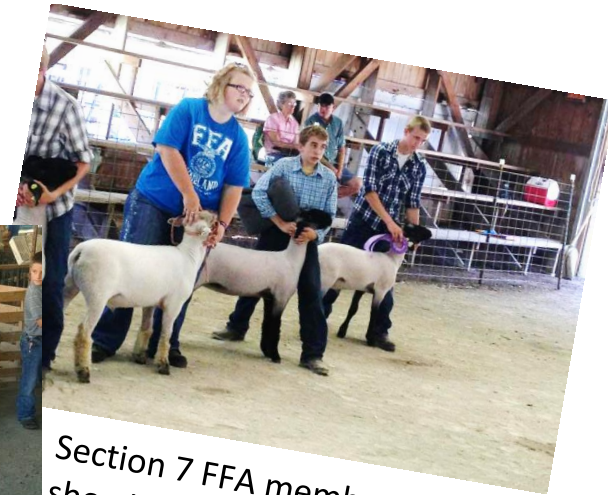
Section 7 FFA members showing their lambs at the fair.